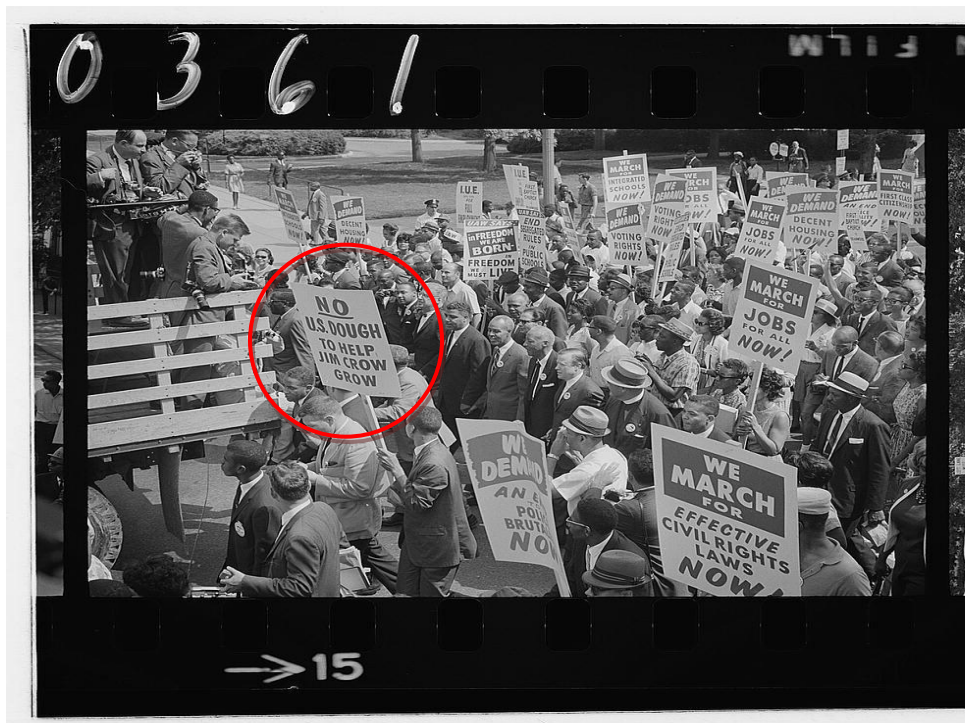
At the March on Washington for Jobs and Freedom, on August 28, 1963, a demonstrator carries a placard calling for the passage of Title VI, "No U.S. Dough to Help Jim Crow Grow."

In 1964, after years of intensive work on the part of civil rights advocates and their supporters in Congress, President Lyndon B. Johnson signed the landmark Civil Rights Act of 1964. Included among the Civil Rights Act's eleven titles is Title VI, codified at 42 U.S.C. § 2000d et seq. In 1963, President John F. Kennedy explained the need for Title VI: "Direct discrimination by Federal, State, or local governments is prohibited by the Constitution. But indirect discrimination, through the use of Federal funds, is just as invidious." Title VI directly addresses the then-common practice of denying certain persons access to federally funded services, programs, and activities based on their race, color, or national origin.