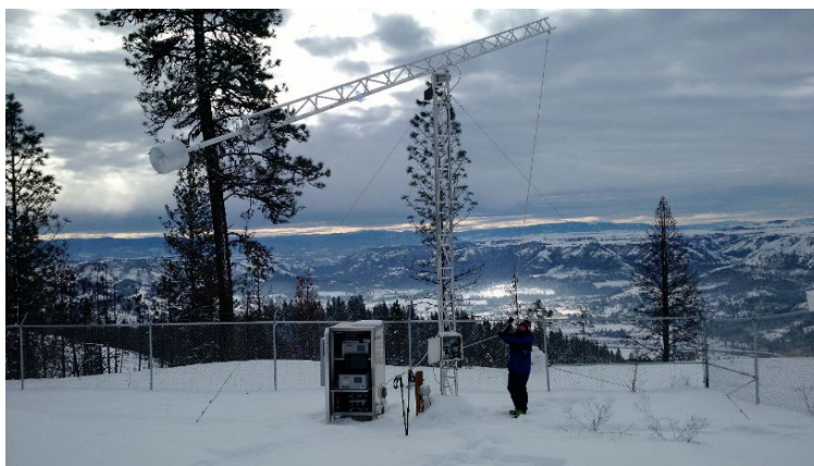
Nez Perce Tribe's CASTNET site (left). Image of a small footprint site with a small, temperature-controlled enclosure housing an ozone analyzer. Site includes a 10-meter tilt down tower. The ozone inlet is in the rain shield on top of the tower.

F= full site with temperature-controlled shelter, filter pack, and ozone; S=small footprint site with filter pack; SO=small footprint site with small enclosure for ozone analyzers