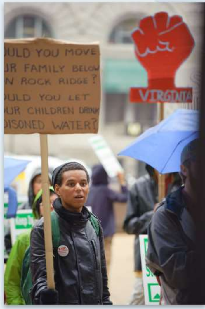
National Environmental Justice Advisory Council A Federal Advisory Committee to the U.S. Environmental Protection Agency