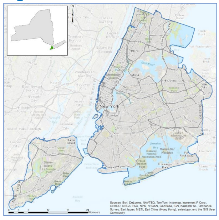
6,382 census block groups.

The New York area is in the Northern Piedmont, Northeastern Coastal Zone, and Atlantic Coastal Pine Barrens ecoregions. However, the area is completely urbanized and little resembles the natural state of any of these ecoregions. The community has a very diverse economy and is a hub for international business and commerce. The largest employers include the City of New York, Metropolitan Transportation Authority, New York City Health and Hospitals, Corp., and JP Morgan Chase & Co. The demographics of the New York community area indicate that the potential exists for income and other disparities in the distribution of environmental assets.