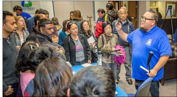
Irvine Ranch Water District Workshop in California.