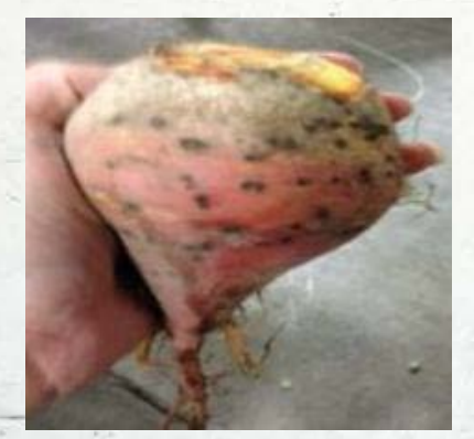
Loose, discolored beets