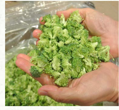
Too small broccoli florets