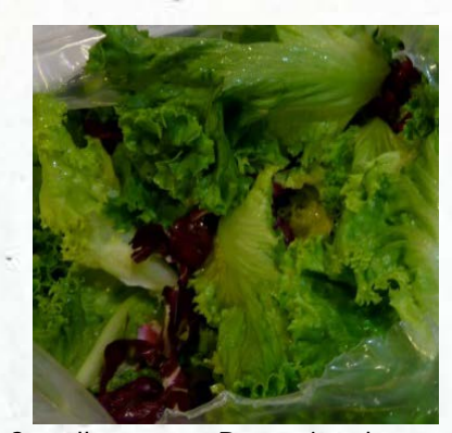
Small, center Romaine leaves