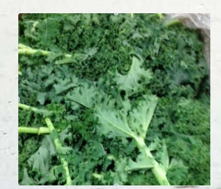
Loose kale leaves