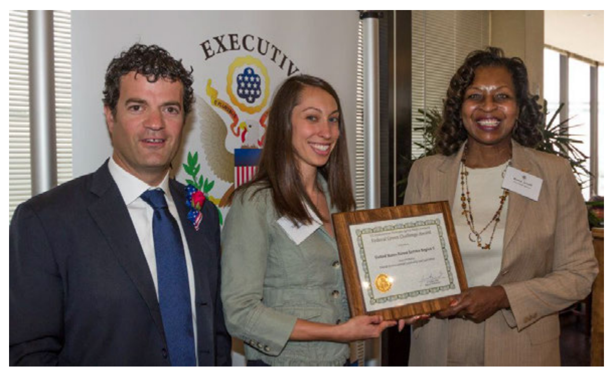
Forest Service FGC awardee.