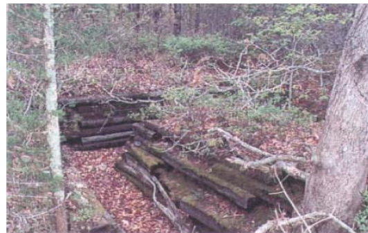
Former Grenade Court Trenchworks (an MRA) – Otis Air National Guard Base

AFCEE will provide periodic updates to the MMR Cleanup Team, a public forum whose meetings are advertised in the local papers and on AFCEE's website. An MMRP page on AFCEE's website has been created and will be updated as more information becomes available. Fact sheets and news releases will be issued to explain the progress that has been made in the MMRP.