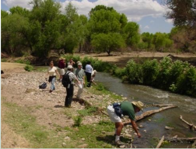
Public access to river