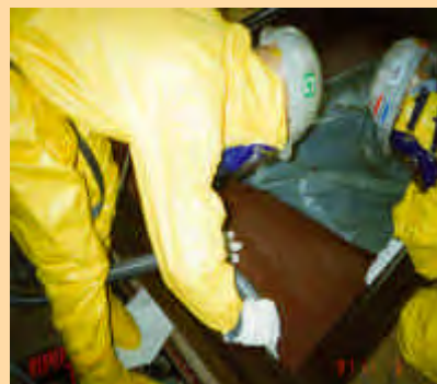
EPA cleaning up a mercury spill at a house.

Any amount of mercury spilled indoors can be hazardous. The more mercury is spilled, the more its vapor will build up in air and the more hazardous it will be. Even a small spill, such as from a broken thermometer, can produce hazardous amounts of vapor if a room is small enough, warm enough and people spend a good deal of time there, as in a small bedroom.