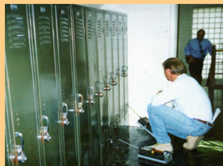
EPA testing air in a school following a mercury spill

If there is a spill the area should be evacuated quickly and cleaned up properly.