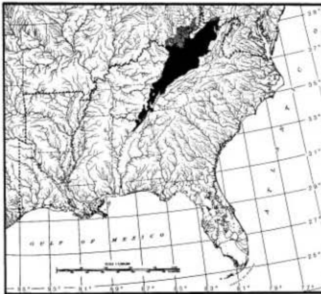
Figure 1. The blackened area illustrates the Mixed Mesophytic Forest Region of the southeastern United States. Taken from Hinkle et. al in Biodiversity of the southeastern United States, upland terrestrial communities.