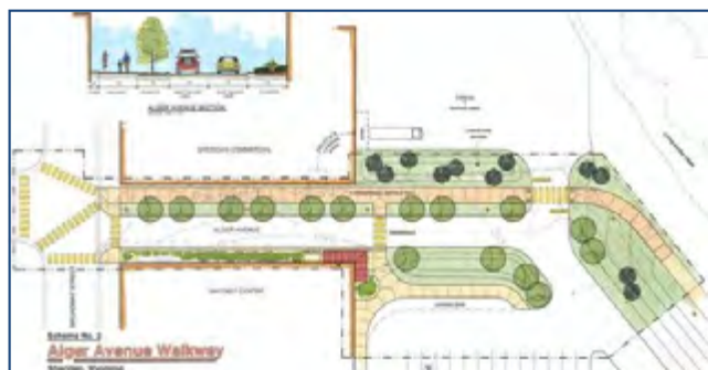
Artist Rendering of Pedestrian Area Near Sheridan's Trail System Along Little Goose Creek