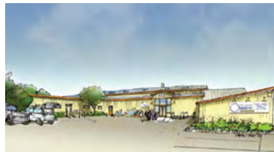
Artist's Rendition of the ReSOURCE Office and Training Building

ReSOURCE, a Nonprofit Community Enterprise is expanding its successful social enterprise and innovative training programs by redeveloping a brownfields property in Barre. The former Buttura & Gherardi Granite Artisans building is being redeveloped to create office and training spaces. The Vermont Department of Environmental Conservation (DEC) provided $11,000 in Section 128(a) Response Program Funding for environmental assessment and contributed technical assistance to the developer and the multi-stakeholder team. Heavy metals, PAHs, and petroleum contaminated soil, as well as several thousand gallon underground storage tanks (UST) and asbestos containing materials were identified during the environmental assessment. Cleanup of contaminated soil is nearly complete and the USTs will be removed in spring 2010. This brownfields reuse project will incorporate green features and create new opportunities for Barre's struggling workforce. The revitalized facility will enable ReSOURCE to create employment, provide job skill training to low-income youth who have dropped out of school, protect the environment by reusing hundreds of tons of materials that would otherwise end up in landfills, and relieve poverty by providing low-cost and free goods to low-income people in rural central Vermont.