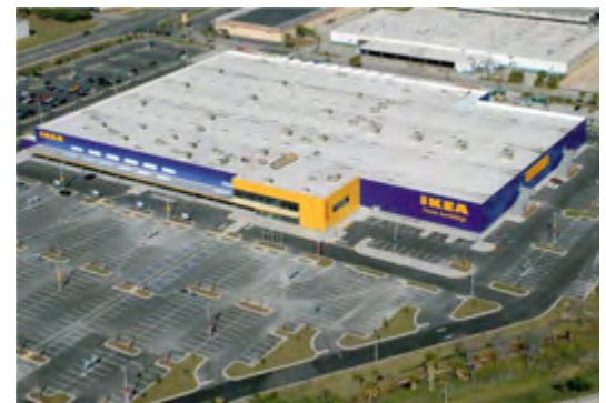
New IKEA Store Located Adjacent to Historic Ybor City and Within the Adamo Corridor

Originally developed and operated as a cannery from 1936 until 1981, the site of Florida's newest IKEA store had been characterized by local media as a "gritty industrial site between the Port of Tampa and Ybor City." Panattoni Development purchased the property in 2005 and entered the Florida Brownfields Redevelopment Program in 2007. IKEA purchased the property in 2008 from Panattoni after most of the environmental remedial work was complete and opened the store in May 2009. The environmental issues associated with the property were managed by removal of underground storage tanks, railroad tracks, and contaminated soil and the use of engineering and institutional controls. The redeveloped 29-acre site now contains a 353,000 square foot store, a 350-seat restaurant and approximately 1,700 parking spaces. The IKEA project created 500 construction jobs and 400 new, in-store jobs. The presence of the IKEA store is expected to be a catalyst for additional redevelopment in the area.