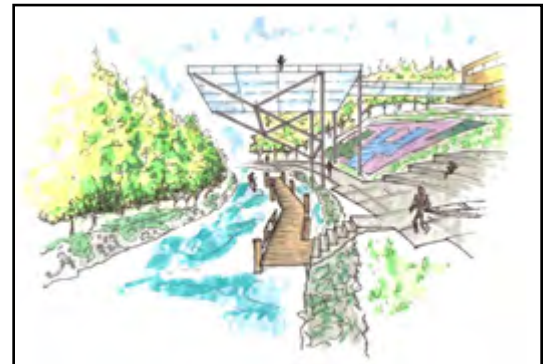
The Collective Results of Community Visioning

“Imagine what you want your community to look like in the future. Now draw it!” Those were the instructions given to a group of citizens who attended a community visioning session in Frankfort. The method used in the Frankfort visioning session was an abbreviated version of the Vision-to-Action process developed by EPA and the U.S. Army Corps of Engineers that has been used across the country. This session was a cooperative effort featuring the Kentucky Brownfields Redevelopment Program, the City of Frankfort, KY Excellence in Environmental Leadership (EXCEL) members, and other brownfields stakeholders. At the session, each attendee drew its vision and presented it to the group. The group then integrated the images and developed a collective vision. After discussing resources and how they can move their communities to action, the end result of the process was a series of drawings that helped communicate a shared community revitalization goal and vision.