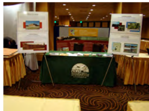
Nevada Brownfields Program Outreach Material at the Nevada Association of Counties Annual Conference

The State of Nevada Brownfields Program attended the Nevada Association of Counties annual conference held November 17-19, 2010 in Reno. State Brownfields staff had the opportunity to meet with county officials and stakeholders to promote the Brownfields program and explain how it has helped municipalities throughout the state and how it can help their communities. New projects have been approved for Clark, Lincoln, Washoe, White Pine, and Nye Counties. A number of public and private organizations from across the state also participated in this unique event that brought municipal officials together for meetings and a chance to "catch-up" on the latest happenings. The exhibition floor was lively and engaging with numerous displays and well-informed experts ready to educate participants about their services.