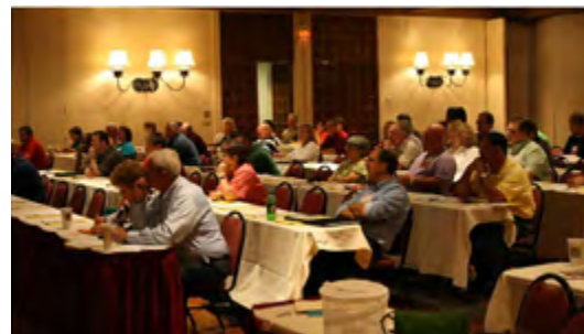
Attendees at Missouri's 6th Annual Brownfields Conference

MoDNR BVCP used Section 128(a) Response Program funding to host its 6th Annual Brownfields Conference on June 21, 2010. The Brownfields Conference provided a platform to celebrate the positive effects—economic, environmental and aesthetic—the BVCP has provided to Missouri through cleanup of over 600 sites, and the continued positive effects the program will have in the future. Almost 200 participants from seven states attended. Attendees included city and community representatives, consultants, state and federal agency staff, and other stakeholders. The conference focused on providing essential information on the identification, remediation, and redevelopment of contaminated properties in Missouri.