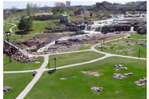
Falls Park Was Expanded All the Way to Downtown Sioux Falls Through This Project