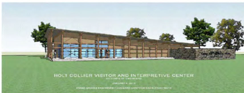
Artist's Rendering of the Holt Collier Environmental Interpretative and Education Center

The highly visible Red Barn on U.S. 61 South of Rolling Fork, Mississippi has been selected as the site of the $6.0 million Holt Collier Environmental Interpretative and Education Center. Because of its proximity to the Holt Collier and Theodore Roosevelt bear hunting site in Sharkey County, the site was selected by local stakeholders with the help of the U.S. Army Corps of Engineers (USACE). Roosevelt hunted the Mississippi Delta at least twice, with one occasion giving rise to the Teddy Bear after a newspaper cartoon depicted Roosevelt declining to shoot a cub. Collier, a former slave, Confederate soldier and noted outdoorsman, guided the president on the hunt. The 33-acre Rolling Fork site also was home to a Native American village during the 1300s and 1400s. The leadership of MDEQ staff, the property owner and USACE worked through the environmental concerns associated with petroleum soil and ground water contamination, which culminated with a Brownfield Agreement between the property owner and the Commission on Environmental Quality on April 22, 2010. The Holt Collier Interpretive and Educational Center will be constructed on the 33-acre plot and is scheduled to open in 2012.