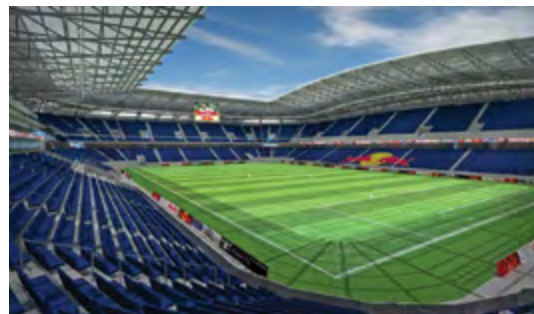
Artist's rendition of the Red Bull Soccer Arena

The Town of Harrison in Hudson County took a huge step toward its revitalization goals with the opening of the Red Bull Arena. This world-class soccer venue was made possible in large part by the efforts of NJDEP. The 25,000-seat Red Bull Arena is the cornerstone of a massive commercial, retail, and residential waterfront redevelopment project that is being coordinated under NJDEP's Brownfield Development Area program, which is funded through its Section 128(a) Response Program grant. The Harrison waterfront was once home to industry along the Passaic River, but over the decades the waterfront disintegrated into a collapsing collection of abandoned factories and warehouses. With help from NJDEP, the structures were demolished and contaminated soil was removed, clearing the way for one of the largest mixed-use redevelopments projects in New Jersey. NJDEP engaged various stakeholders, including owners of contaminated properties, potentially responsible parties, developers, community groups, and local governments to participate in developing the cleanup and revitalization strategies.