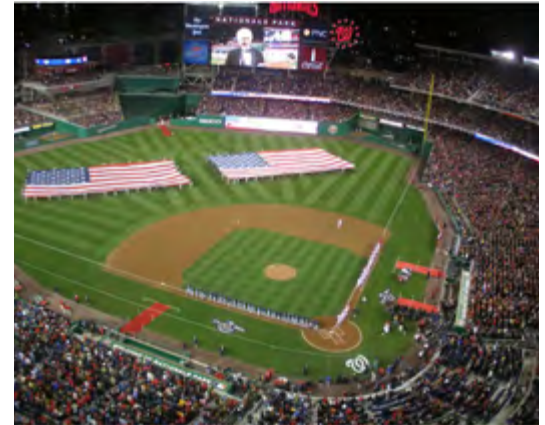
March 30, 2008 - Opening Day Ceremonies at Nationals Park

How often do over forty thousand people and the President of the United States attend the grand opening of a completed voluntary cleanup project? It happened at the opening day ceremonies for the 2008 Washington Nationals baseball season on March 30, 2008. Nationals Park, the nation's first Leadership in Energy & Environmental Design (LEED) Silver Certified professional sports stadium, is the largest voluntary cleanup project in the District of Columbia. With oversight from the District Department of the Environment (DDOE), a Section 128(a) Response Program grantee, over 350,000 cubic yards of contaminated soil were removed from the former industrial area. Ground water filtration and treatment will continue through a state-of-the-art ground water collection system operating beneath the stadium.