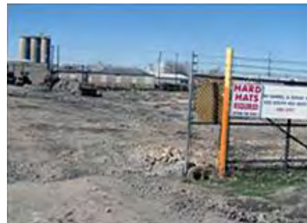
Artspace Site Before

Artspace, a nonprofit group, purchased the former Utah Barrel and Scrap site in downtown Salt Lake City in November 2007. Artspace addressed the contaminated soil and ground water under an EWA and the VCP. Artspace received a COC in May 2009, completed construction, and opened the Artspace Commons facility for commercial and residential use in October 2010. The building has many features that contribute to a certification by the nonprofit U.S. Green Building Council. This includes the use of recycled materials, solar photovoltaic window awnings, and water reduction features. Approximately 350 construction jobs and 35 permanent jobs were created as a result of this project.