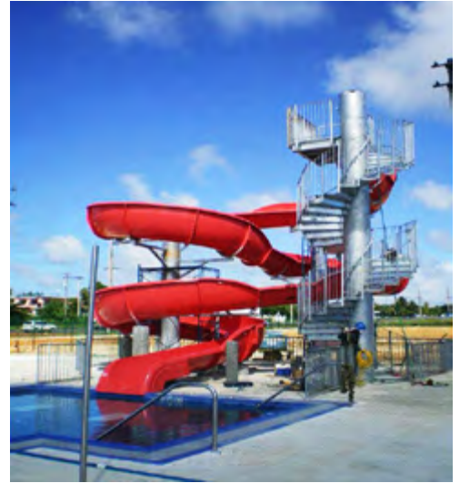
New Water Park Redeveloped on Former Brownfields Property

http://guamepa.net/Guam_Underground_Storage_Tank_Regulations_(Draft_Final_v._02DEC10)[1].pdf