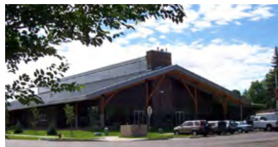
The New City of Show Low Public Library

Due to unprecedented growth, the City of Show Low developed a plan to expand city facilities and infrastructure. Included in the plan was the construction of a new library. ADEQ used Section 128(a) Response Program funding to conduct Phase I and Phase II environmental site assessments (ESA) at the new library location. The results of the Phase II ESA revealed petroleum-related contamination on property. After the removal of contaminated soil, construction began in 2009 and the new library opened in August 2010. The 20,000-square foot library offers a 50% increase in capacity with a second phase designed to accommodate future expansion. A 150-foot clerestory window brings daylight deep into the main hall while other sustainable features include the use of low-VOC and recycled-content finishes, high-efficiency plumbing and mechanical equipment, and regional materials, such as Arizona stone.