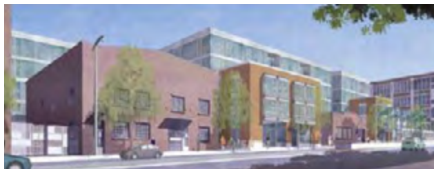
Artist Rendering of New LEED Residential Development in of San Francisco

DTSC loaned $1.6 million in American Recovery and Reinvestment Act (ARRA) funds to the Martin Building Company to accelerate cleanup at a former scrap iron and metal yard located in the Central Waterfront District of San Francisco to construct residential development. The company used ARRA funds to remove lead-contaminated soil and properly dispose of it at a permitted landfill. It leveraged the funds to obtain financing to construct the project. The residential development will consist of over 180 new rental housing units (39 designated as below market rate), space for restaurants and retail businesses, easy access to public transportation, underground parking, onsite subsidized day care and several "pocket plazas." The development will be built according to LEED gold certification criteria and has created about 200 construction jobs.