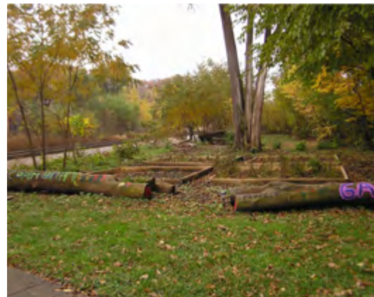
Blue Island Community Gardens Project

Working with the City of Blue Island, Illinois, EPA used Section 128(a) Response Program funds to conduct a site-specific brownfields assessment of vacant lands that are planned for expansion of the Blue Island community gardens project. The area identified for garden expansion lies immediately west of the Indiana Harbor Belt rail line and east of the Canadian National Rail lines. Analytic results from this environmental assessment will provide the information necessary to determine if fruits and vegetables grown on the property are safe for consumption. Blue Island, Illinois is a 4.5 square mile, 170-year-old city of 22,325 people located at the southwest corner of Chicago. Known as the historic heart of the Chicago Southland, Blue Island has been dominated by heavy industry food processing, oil refining, brick making and railroads.