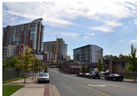
The Gulch in Nashville was a Former Railroad Industrial Area and is Now a Bustling Mixed-use Neighborhood

The Gulch, a 60-acre property just south of downtown Nashville, was a railroad industrial area since the 1800s equipped with a coal yard and paint shop. The Tennessee VOAP used Section 128(a) Response Program funding to address several key properties to complete Brownfields Voluntary Agreements. The property is now a mixed-use urban neighborhood that includes restaurants, shops, and urban living. Public transportation can be accessed within a quarter mile and more than 6,000 jobs are within a half mile. The Gulch was chosen to receive the prestigious international Leadership in Energy and Environmental Design (LEED) certification.