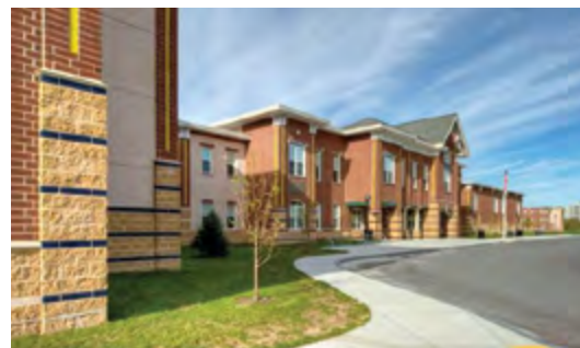
The New Woonsocket Middle School Campus

A 20-acre former industrial area was redeveloped into the Woonsocket Middle School Campus, the largest middle school campus in New England. With the support of EPA and the Rhode Island Department of Environmental Management (RIDEM), the City of Woonsocket successfully implemented a proactive public outreach strategy to address school siting and environmental justice concerns in a forthright and transparent manner. RIDEM used Section 128(a) Response Program funding to assist with the characterization of the property. The EPA, RI Economic Development Corporation and RIDEM Brownfield programs using 128(a) money provided almost $2 million in brownfields grant funding for assessment and cleanup of the property, as well as oversight and feedback. Results of environmental assessment activities revealed that substantial contamination was present throughout the property. Cleanup costs to ensure that the school was safe totaled approximately $6 million. The project schedule was met while staying under budget and the campus opened for occupancy in January 2010.