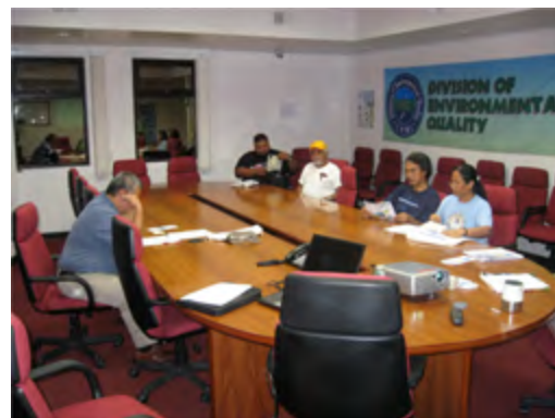
Public Meeting with Land Owners to Educate Them about the Assessment Program

In FY 2010, CNMI DEQ developed its mission, vision, and structure of its State Response Program (SRP). The agency continues to work further towards developing and enhancing its SRP. In FY 11, CNMI DEQ will complete the development of its Voluntary Response Program (VRP) guidance document and its VRP regulations.