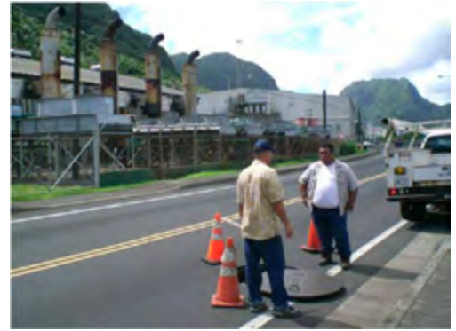
AS EPA Staff Conducting Assessment Activities

http://asepa.gov/hazardous-materials.asp