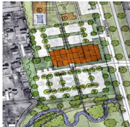
Artist's Rendition of the Redevelopment Area

Located one block west of downtown Anniston, the 22-acre Chalkline, Inc. mill began operation as the Anniston Manufacturing Company in 1888 and closed in 1994. After the facility closed, the property was sold and the buildings were deconstructed, creating a significant scar of debris and rubble on the landscape. The city bought the property and the Alabama DEM used Section 128(a) Response Program funds to conduct assessment activities at the property. The city was then awarded an EPA Brownfields Cleanup grant and an Appalachian Regional Commission (ARC) grant. With remedial activities slated to be complete in 2011, construction is planned for a new Department of Human Resources building. In addition, a section of Snow Creek near the south end of property that has been channeled for over 100 years will be restored to a free flowing stream. The 33-mile Chief Ladiga Trail, built on abandoned railway rights-of-way, will be extended six miles from the Town of Weaver to the former mill property. And, a new federal courthouse will be constructed at the former auto parts repair property adjacent to the Chalkline property. Local officials believe that these brownfields projects will spur other public and private revitalization efforts in the downtown Anniston area.