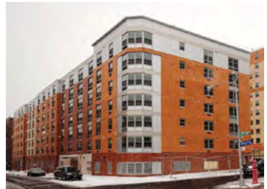
Courtlandt Corners Mixed-income Housing Developments in the Melrose Commons Neighborhood of Bronx, New York

Participation in New York's Brownfield Cleanup Program made it possible for developers to create a mixed-income housing development for 323 families on one of the few available parcels in the South Bronx. DEC uses Section 128(a) Response Program funds to help administer the BCP. Courtlandt Corners consists of two sites directly across from each other on East 161 st Street between Melrose and Courtlandt Avenues. Previous site uses include an auto repair shop and gas station. Petroleum contaminants were detected in the soil and groundwater, as well as soil vapor samples. Under the remedial action workplan developed through the BCP, contaminated soils were removed, groundwater was pumped and treated, and a vapor barrier and sub-slab depressurization system were installed. The buildings, which include ground-floor commercial space, became available for new tenants at the end of 2010.