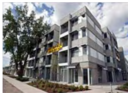
Artspace Site After