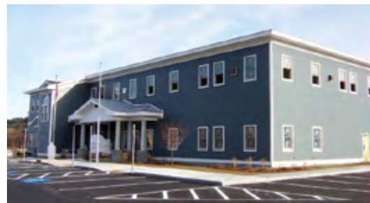
The New Berlin District Courthouse Building

Dating back to the 1800s, the Brown Paper Company conducted a pulp and paper mill operation, including supporting railroad operations located on the east side of the Androscoggin River in Berlin. To revive this blighted area, the New Hampshire Department of Environmental Services (DES) provided the City of Berlin technical assessment services through its Section 128(a) Brownfields State Response Program grant. The grant funding enabled the city to conduct Phase I and Phase II environmental assessments on the property and address soil and ground water contamination likely associated with historic activities. Anticipated development outcomes from this project include a riverfront walk and additional recreational trails. DES is currently providing cleanup planning assistance through the Brownfields Coalition Assessment Grant.