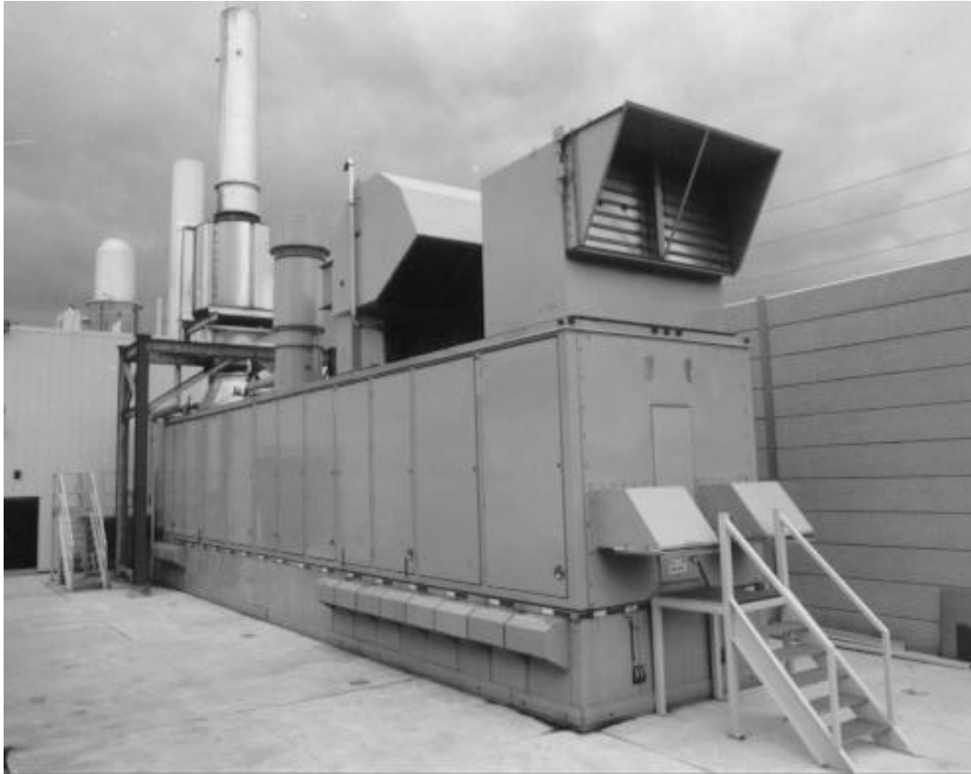
3.5 MW gas-fueled standardized cogeneration system at Trigen Energy Corporation facility in Ontario