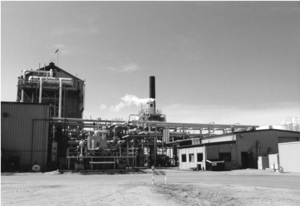
Sand Creek Chemical Plant in Commerce City, Colorado (uses conventional natural gas to produce methanol)