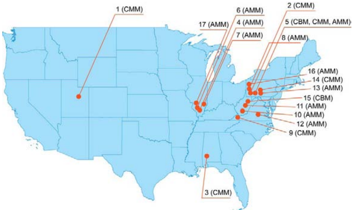
Figure 2. Locations of Operating CMM Upgrade Facilities

The first CMM upgrade facility in the U.S. was installed by BCCK Engineering, Inc. in 1997 in Southwestern Pennsylvania. Since then, 13 additional commercial-scale CMM upgrade facilities have come on line at active and abandoned mines, and three additional facilities are awaiting start up. Figure 2 shows the locations of these projects, while Table 2 lists these facilities, including their location, type of feed gas, and throughput capacity.