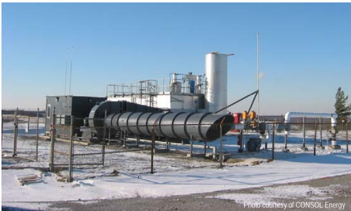
Figure 1. MEGTEC's VOCSIDIZER installed at CONSOL Energy's Windsor Mine Portal in West Virginia.