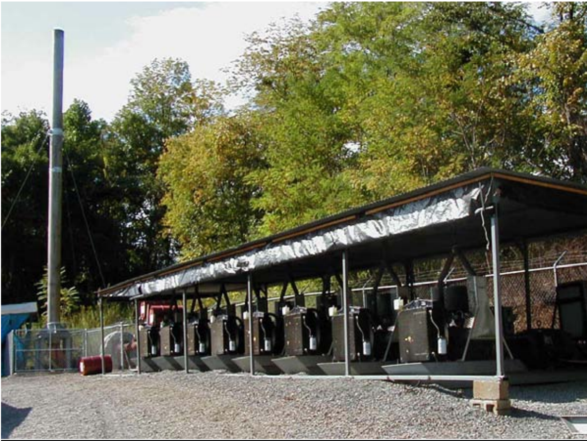
675 kW Synchronous Skid-Mounted Generator sets at Nelms No. 1 Mine, Ohio