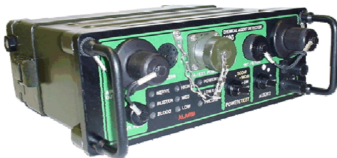
Figure 2-1. Environics USA M90-D1-C CW Agent Detector

The M90-D1-C CW agent detector is designed to detect and identify nerve, blister, blood, and choking agents using Environics' patented open-loop ion mobility spectrometry (IMS) technology to provide continuous real-time operation without the need for expendable desiccant cartridges or membranes. The M90-D1-C is fully automatic and provides the operator with audible and visible alarms upon detecting CW agents. The M90-D1-C display identifies the agent class (Nerve, Blister, Blood), indicates the relative agent concentration (Low/Medium/High), and indicates whether the concentration is increasing or decreasing. This alarm information can be provided to a remote computer/control station through the data connector on the M90-D1-C. The M90-D1-C can be upgraded to detect new agents by changing data libraries. It is fully ruggedized to meet appropriate military standards.