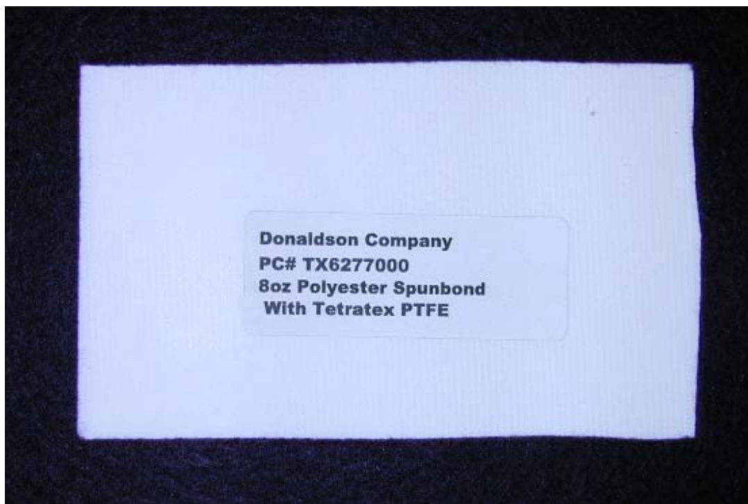
Figure 1. Photograph of Donaldson Company, Inc.'s 6277 filtration media