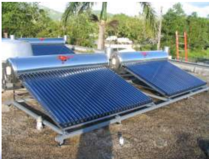
Janssen Gurabo, Puerto Rico Domestic Hot Water