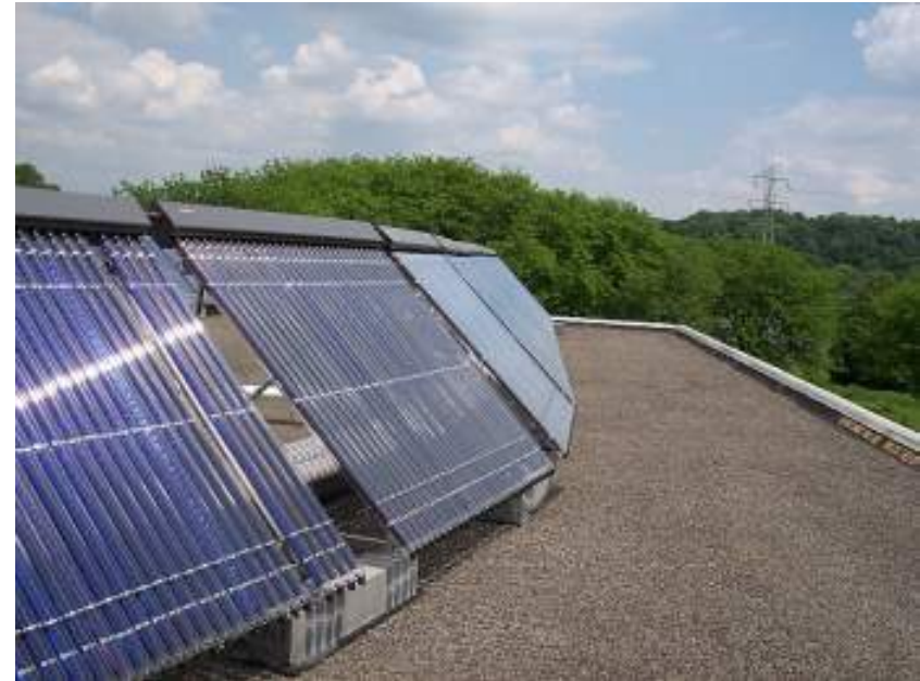
J&J China, Shanghai: Domestic Hot Water