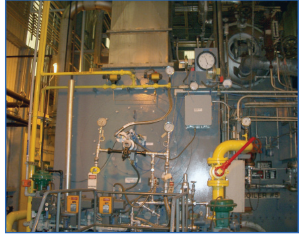
Mallinckrodt, Inc. Raleigh, NC

NASA Goddard Space Flight Center. In early 2003, NASA's Goddard Space Flight Center in Greenbelt, Maryland, began firing LFG in two Nebraska watertube boilers, each capable of producing 40,000 pounds per hour of steam. The gas is piped approximately five miles from the Sandy Hill Landfill to the boiler house at Goddard. NASA modified the burners and controls to co-fire LFG, natural gas, and oil; however, LFG provides the total firing requirement for approximately nine months of the year. Later, a third boiler also began utilizing LFG. NASA estimates an annual savings of more than $350,000. Current NASA plans call for LFG use to continue for at least 10 years, with a possible extension to 20 years. LMOP Partners Toro Energy and CPL Systems developed and implemented the project.