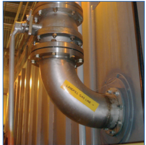
Mallinckrodt, Inc. Raleigh, NC

Utilization of landfill gas (LFG) in place of a conventional fuel such as natural gas, fuel oil, or coal in boilers is an established practice with a track record of more than 25 years of success. In the United States, more than 60 organizations have switched to the use of LFG in their industrial, commercial, or institutional boilers, with more than 70 boilers operating with LFG, either alone or co-fired with other fuels. Boilers firing LFG range in size from 2 to more than 150 million British Thermal Units per hour (MMBtu/hr). Companies using LFG are saving money while protecting the environment. General Motors fires LFG in boilers at four of their manufacturing and assembly plants and reports that they have realized energy cost savings of about $500,000 per year at each of the four plants.