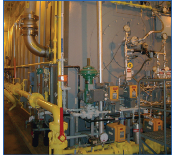
Mallinckrodt, Inc. Raleigh, NC

In designing and assessing the economic feasibility of projects utilizing LFG in boilers, several factors in addition to the boiler retrofit must be considered. For example, the quantity of LFG available must be considered and compared to the facility's steam needs and boiler capacities. Factors such as pipeline right-of-way issues and the distance between the landfill and the boiler will influence costs and the price at which LFG can be delivered and sold to the boiler owner. Because LFG is generally saturated with moisture, gas treatment is needed before the LFG is introduced into the pipeline and subsequently the boiler, to avoid condensation and corrosion. Additionally, condensate knock-outs along the pipeline are necessary as condensation in the main pipeline can cause blockages. Fortunately, the level of LFG clean-up required for boiler use is minimal, with only large particle and moisture removal needed. Other compounds in LFG, such as siloxanes, do not damage boilers or impair their function. Generally, LFG clean-up and compression systems are located at the landfill and are often installed by a developer rather than by the boiler owner. LFG compression provided at the landfill must be sufficient to compensate for pipeline pressure losses and provide sufficient pressure at the boiler to permit proper function of the fuel controls and burner. Proper attention to burner selection or burner modification for low-pressure operation can minimize the LFG compression costs.