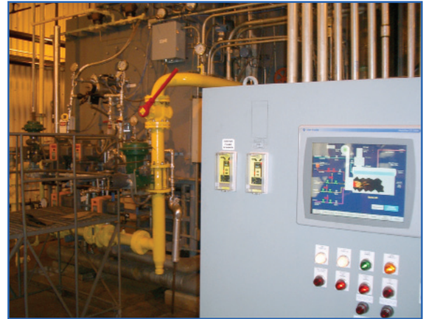
Mallinckrodt, Inc. Raleigh, NC

The equipment for retrofitting a boiler to burn LFG is commercially available, proven, and not overly complex. The decisions that must be made during engineering and design are, however, site-specific and may be somewhat involved. For example, some installations have retained the original burner but modified it for LFG (e.g., by installing separate LFG fuel train and gas spuds) while maintaining the existing natural gas fuel train and gas ring to permit LFG/natural gas co-firing. Other installations