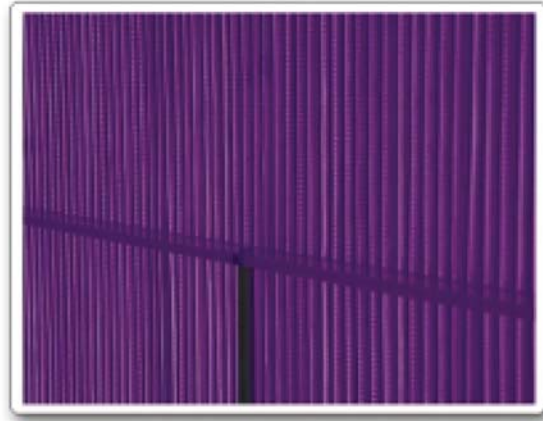
EPS™ filtration system in sterilization mode.