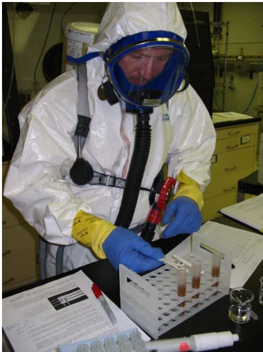
Figure 6-2. Testing of the OP-Stick Sensor with the Non-Technical Operator Wearing PPE