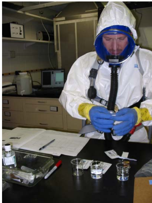
Figure 6-2. Testing of Eclox™-Pesticide Strips with the Non-Technical Operator Wearing PPE