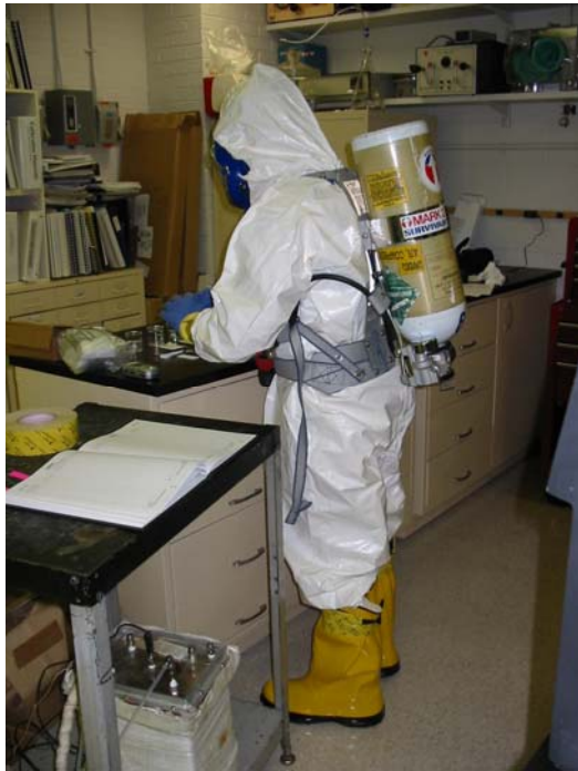
Figure 6-1. Side View of PPE Worn by Non-Technical Operator