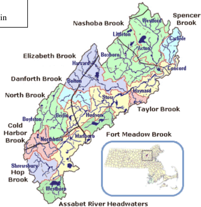
Graphic Courtesy of the Massachusetts Organization of the Assabet River (OAR)