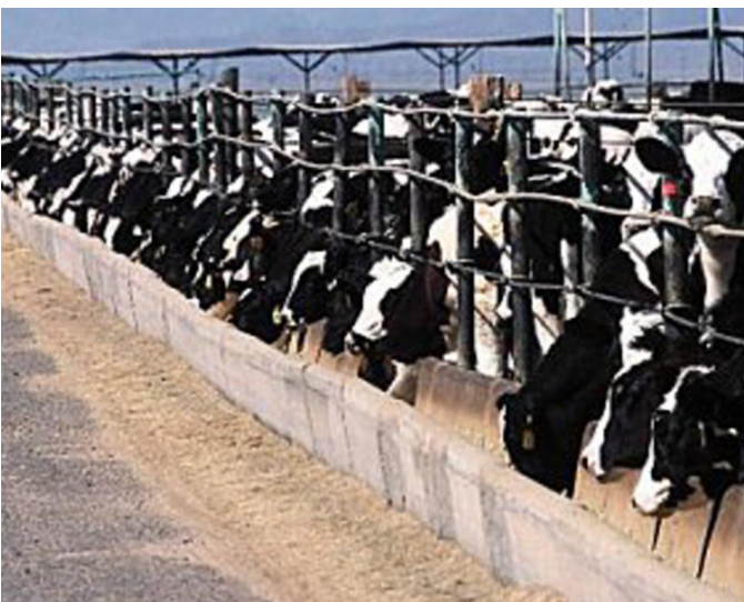
Concentrated Animal Feeding Operation (CAFO)