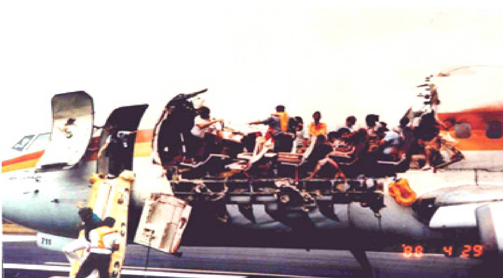
AIRCRAFT ACCIDENT REPORT ALOHA AIRLINES, FLIGHT 243 BOEING 737-200, N73711, NEAR MAUI, HAWAII APRIL 28, 1988