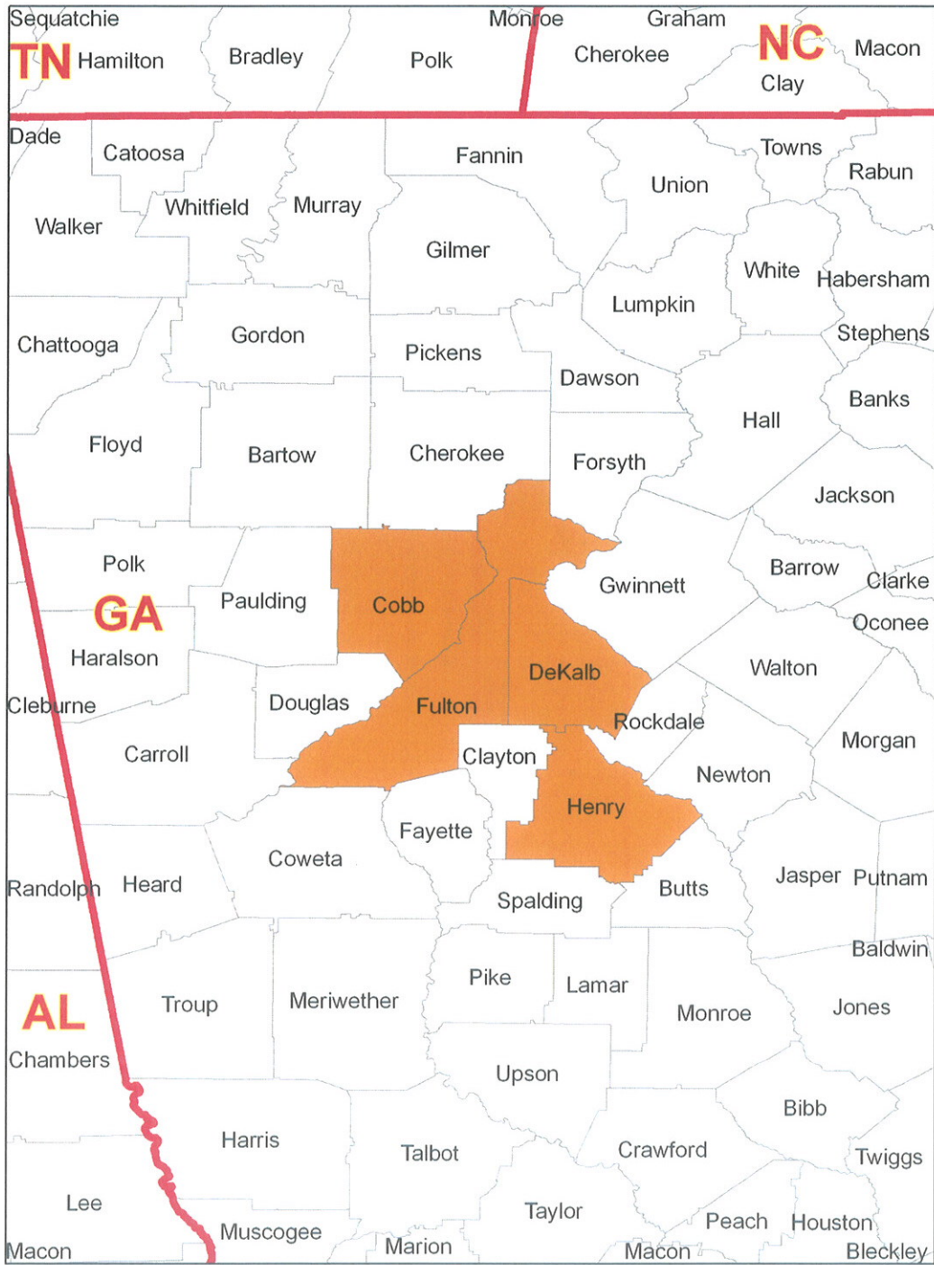
Figure 2: Map of Atlanta nonattainment area recommendations for the revised 2008 ozone NAAQS.