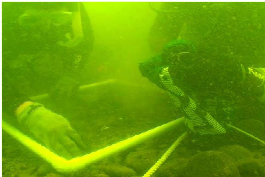
East Brady, Pennsylvania Freshwater Mussel Survey August 2010