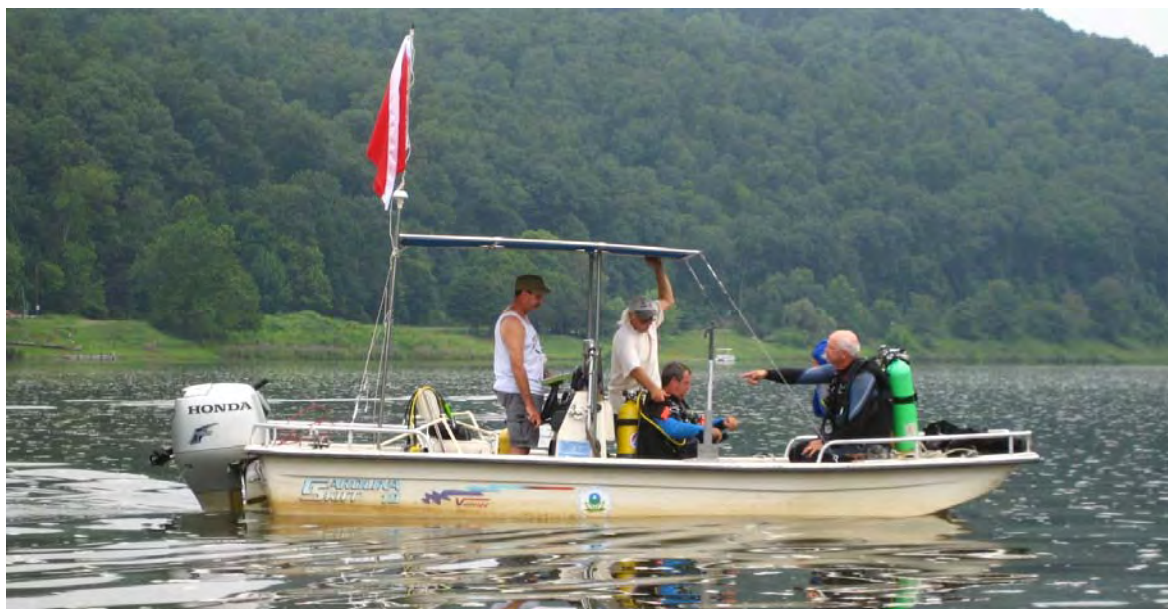
East Brady, Pennsylvania Freshwater Mussel Survey June 2010