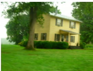
Left corner: faculty living quarters