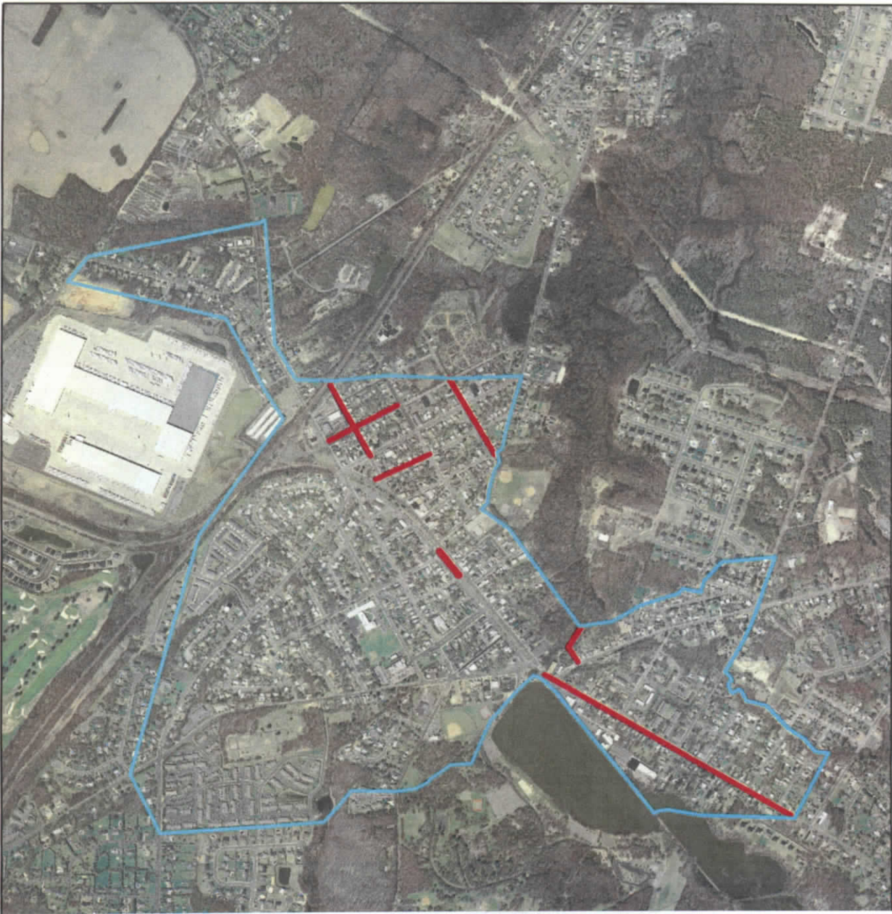
Figure 1: Borough of Jamesburg Wastewater System Upgrades Project