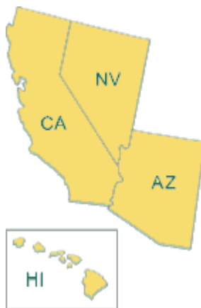
EPA Region 9