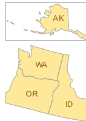
EPA Region 10