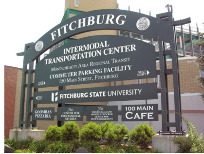
Intermodal Transportation Center at 150 Main Street

estate. The FRA has been working with the university to redevelop a section of North Street to become a formal gateway to the campus. This effort has involved assembly of parcels and EPA-funded assessments, which have cleared the way for construction. The enhanced entrance will bring the university physically closer to the downtown and symbolically strengthen ties between the institution and the city, helping meet a key objective of the urban renewal plan.