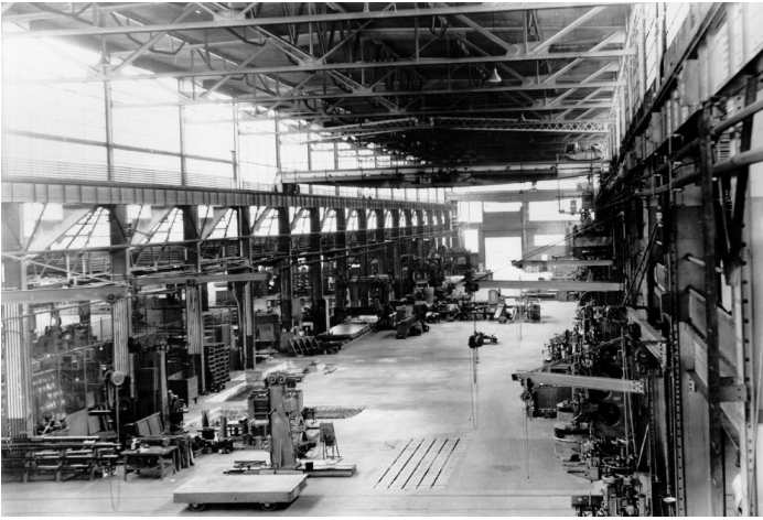
Interior of machine shop at GE's Fitchburg plant, 1942