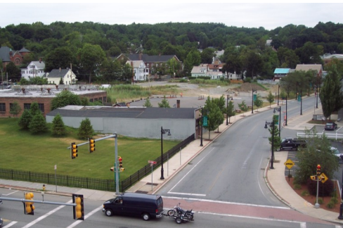
Top: Future site of student housing at 26 Willow Street Bottom: Future gateway to Fitchburg State University at North Street