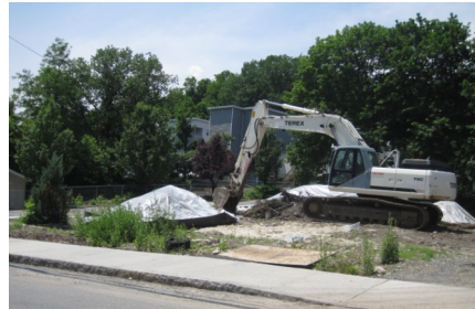
Clockwise from upper left: Coolidge Park, Central Steam Plant, site of new affordable housing on Elm Street

to a pile of rubble. The site was an eyesore and liability given the unknown level of environmental contamination. Funded through the 2001 and 2003 EPA grants, the Phase I and Phase II Environmental Site Assessments (ESAs) initiated the redevelopment process. After the assessments were complete the city was able to leverage other funding sources, such as a $825,000 Urban Self Help Grant from the Massachusetts Executive Office of Energy and Environmental Affairs, to complete the site cleanup and redevelopment as a public park.