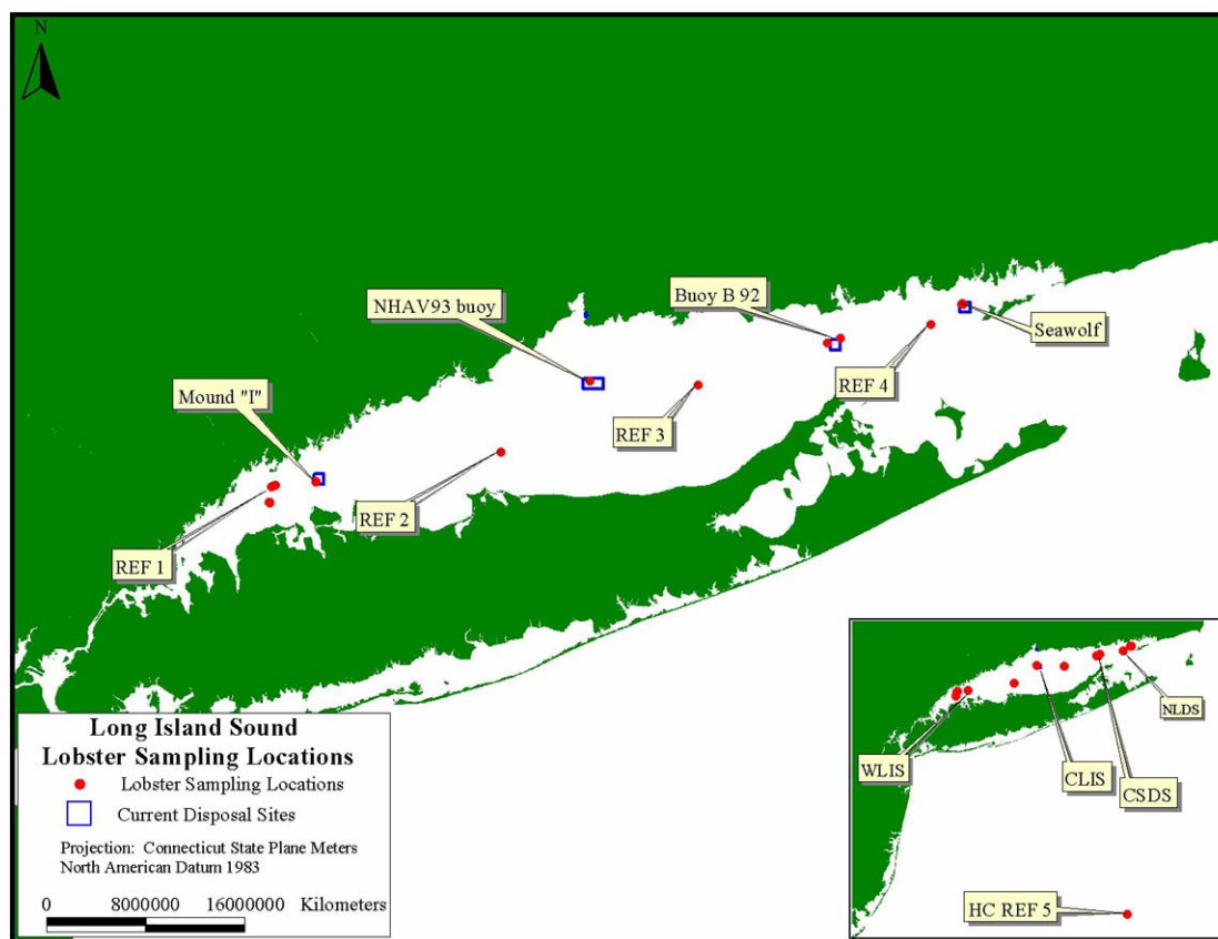
Figure 1. Lobster Sampling Locations.

After collection, all samples were transferred to Woods Hole Group (WHG) in Wareham, MA. Samples were dissected and composited by matrix (meat, hepatopancreas, carapapice) at WHG and were stored frozen. Sample custody was transferred to Battelle on 1/22/02. Upon receipt at Battelle, all samples were logged in, assigned new Battelle IDs and stored frozen until further processing and analysis.