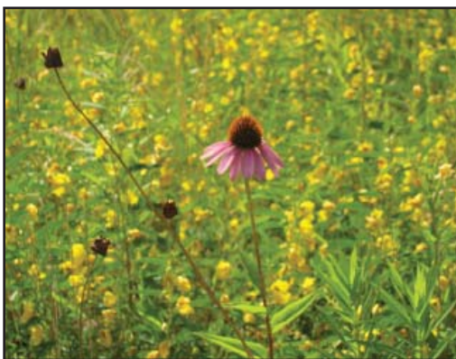
Purple Cone Flower and Partridge Pea

FOR ADDITIONAL INFORMATION AND REFERENCES VISIT THIS WEB PAGE: