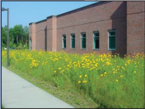
The Natural Landscaping at EPA's Laboratory

The Laboratory's landscaping is a beautiful natural ecosystem utilizing mostly native plants.