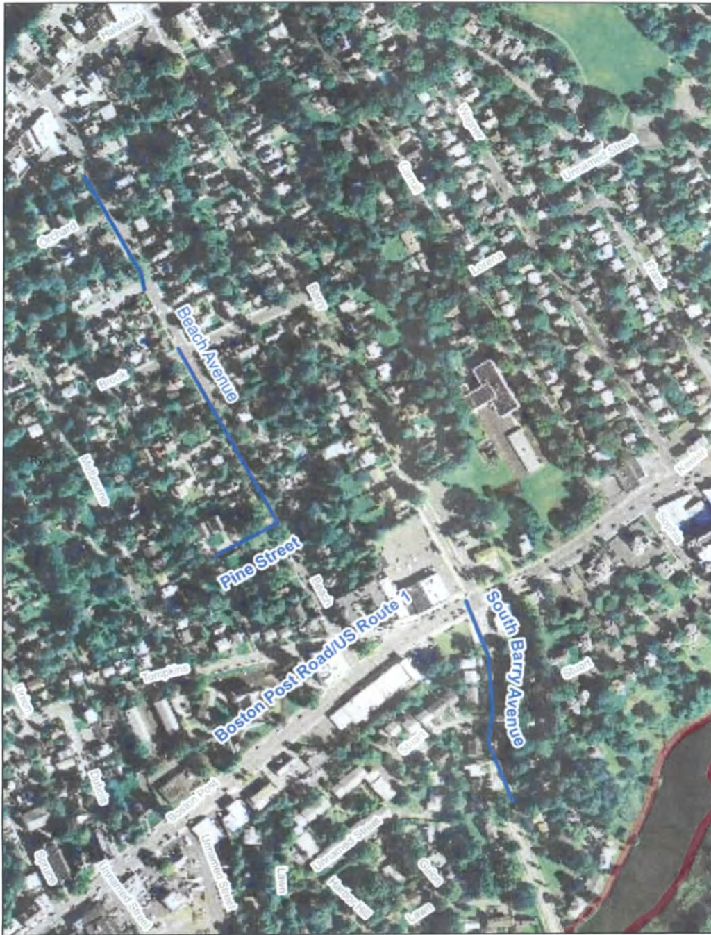
Figure 1: Mamaroneck Drainage Improvements Project