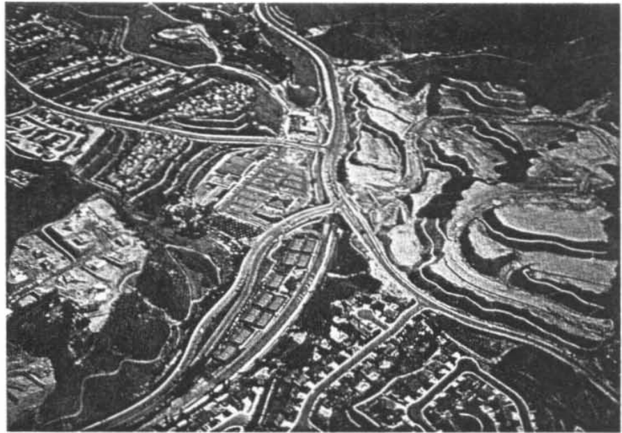
AERIAL PHOTO of landform-graded region in Anaheim Hills. Note irregular patterns formed by landform-graded slopes along perimeter of lot pads.

Mother Nature is full of surprises. She knows how to control erosion without using the clumsy terrace drains we use in man-made slopes. We've minimized the visual impact of the required concrete drains by running them diagonally and curvilinearly across the slopes, which makes them considerably less visible. We also line them with river rock, so when they are visible they complement the landform slope aesthetics.