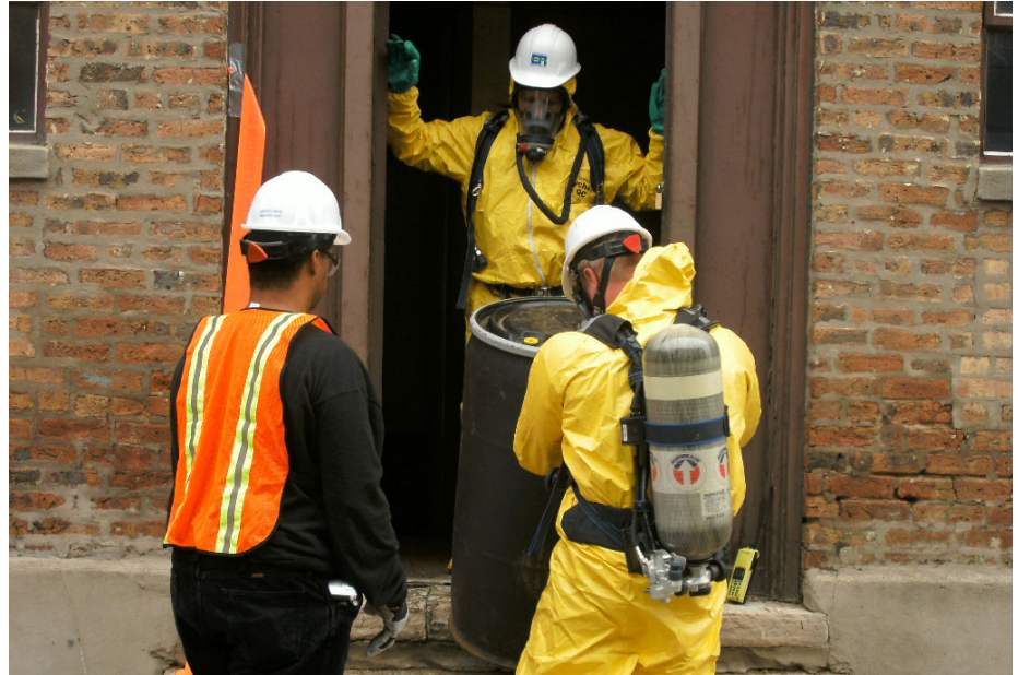
Emergency response workers remove hazardous wastes from Economy Plating.