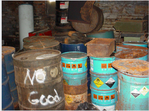
Drums in the basement of Economy Plating.

Once these activities are completed, EPA will transfer the site back to the authority of Chicago DOE or to Illinois EPA for further cleanup actions if necessary.