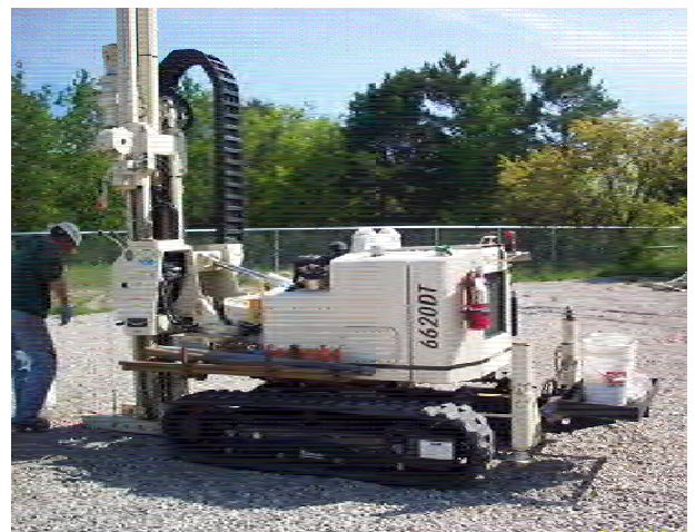
Equipment such as this Geoprobe may be used to collect samples in the Little Scioto River.

Samples will also be taken in the northern portion of the river, which was the target of cleanup work in 2002 and 2006. These new samples will provide information about long-term protection from pollutants.