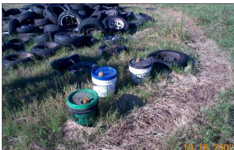
Illegal Dumping Continues to Occur On-site

The Agriculture Street Landfill Site was first authorized for use as a dump in 1909, when the City of New Orleans was engaged in an effort to phase out the dumping of municipal wastes and trash into various canals in the vicinity and into the Mississippi River. The landfill continued to be used until the city constructed its Florida Avenue and Seventh Street incinerators in 1957. The landfill was reopened in 1965 for approximately one year for a burning and disposal area for debris created by Hurricane Betsy.