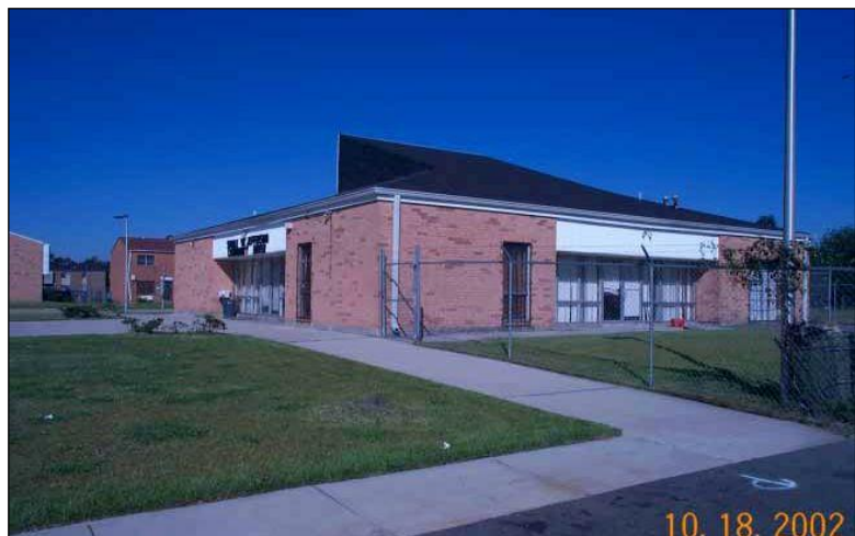
Community Center prior to Hurricanes Rita and Katrina