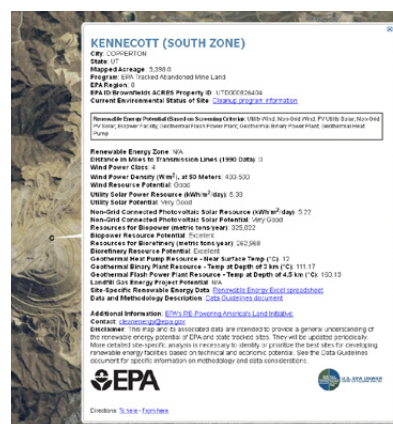
Screenshots from the Google Earth interactive mapping tool