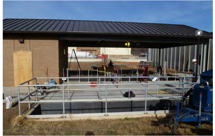
Ultraviolet (UV) disinfection system under construction

Today, the city is growing again and serves as a regional center for retail, health care, higher education, and tourism. The city operates two wastewater treatment plants (WWTP) known as the Turkey Creek and Shoal Creek Plants, both built in the 1980s. By 2009, both facilities were nearing capacity and the city devel-