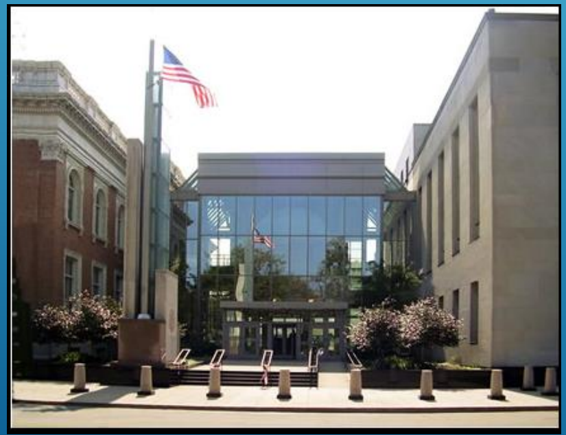
Main entrance into the complex.