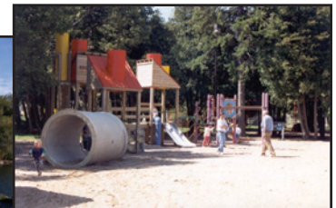
EnviroPark, Collingwood