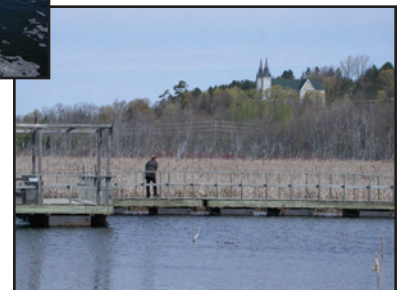
Wye Marsh, Severn Sound

Effective actions are often based on collaborative work. In 2005, The Nature Conservancy, the State of Michigan and The Forestland Group (a limited partnership), collaborated in a sale and purchase agreement that created the largest conservation project in Michigan's history. This purchase will protect more than 110,000 hectares (271,000 acres) through a working forest easement on 100,362 hectares (248,000 acres) and acquisition of 9,445 hectares (23,338 acres) in the Upper Peninsula of Michigan. By connecting approximately one million hectares (2.5 million acres), the project curbs land fragmentation and incompatible development by establishing buffers around conservation sites such as the Pictured Rocks National Lakeshore and Porcupine Mountains Wilderness State Park.