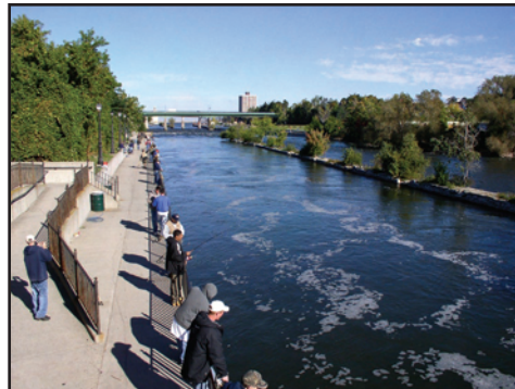
Varrick Dam North, Oswego River

The Oswego River AOC on Lake Ontario was delisted in 2006, the first removal of an AOC designation in the United States. In Canada, two AOCs have been delisted, both on Lake Huron (Collingwood Harbour in 1994 and Severn Sound in 2003). Delisting of an AOC occurs when environmental monitoring has confirmed that the remedial actions taken have restored the beneficial uses in the area and that locally derived goals and criteria have been met.