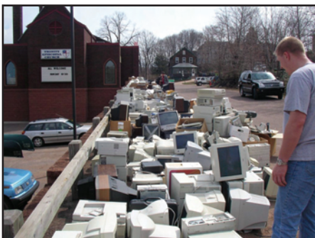
Electronic Waste Collection

Effective actions are often based on collaborative work. In 2005, The Nature Conservancy, the State of Michigan and The Forestland Group (a limited partnership), collaborated in a sale and purchase agreement that created the largest conservation project in Michigan's history. This purchase will protect more than 110,000 hectares (271,000 acres) through a working forest easement on 100,362 hectares (248,000 acres) and acquisition of 9,445 hectares (23,338 acres) in the Upper Peninsula of Michigan. By connecting approximately one million hectares (2.5 million acres), the project curbs land fragmentation and incompatible development by establishing buffers around conservation sites such as the Pictured Rocks National Lakeshore and Porcupine Mountains Wilderness State Park.