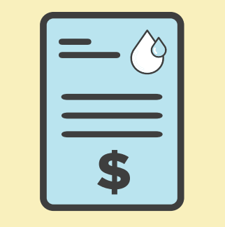
at your <u>water</u> <u>utility bill</u>.