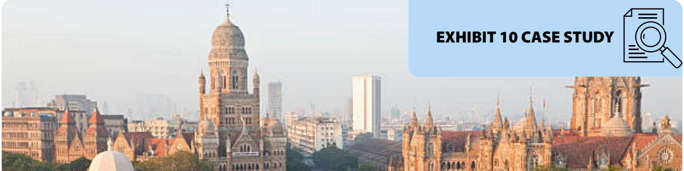
EXHIBIT 10 CASE STUDY

For more information, see Reducing Plastic Pollution: Campaigns That Work and Thailand bans single-use plastic bags .