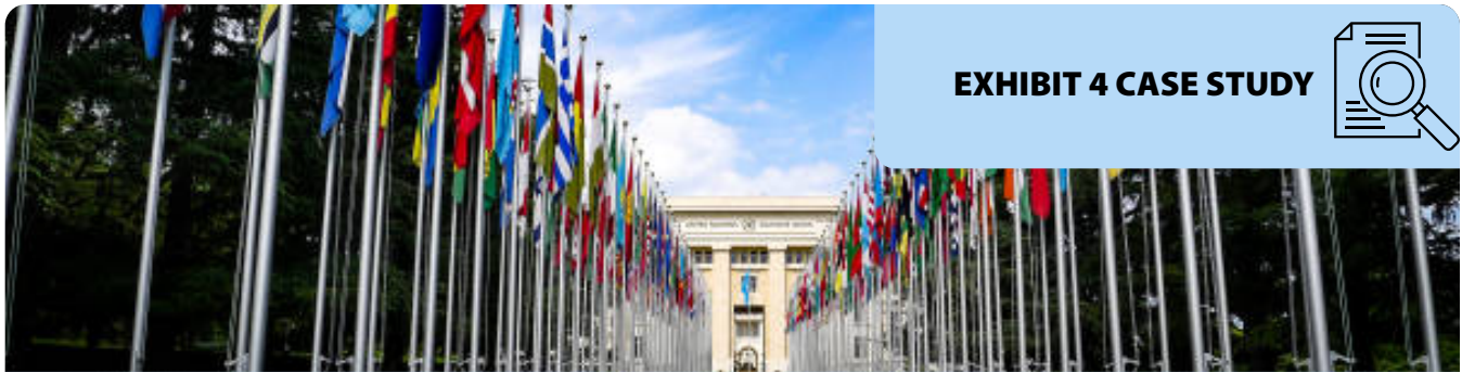
EXHIBIT 4 CASE STUDY