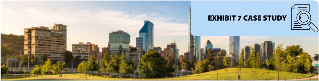
EXHIBIT 7 CASE STUDY