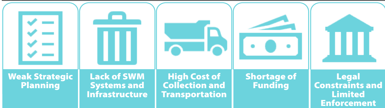
Exhibit 2. Challenges to Managing Plastic Waste

Cities face many challenges when managing plastic waste (Exhibit 2). Common challenges include: