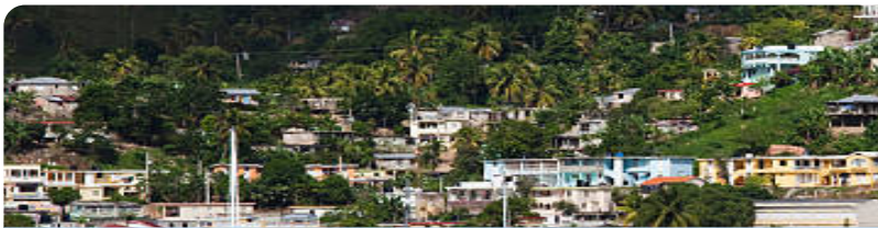
EXHIBIT 6 CASE STUDY