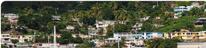
EXHIBIT 11 CASE STUDY