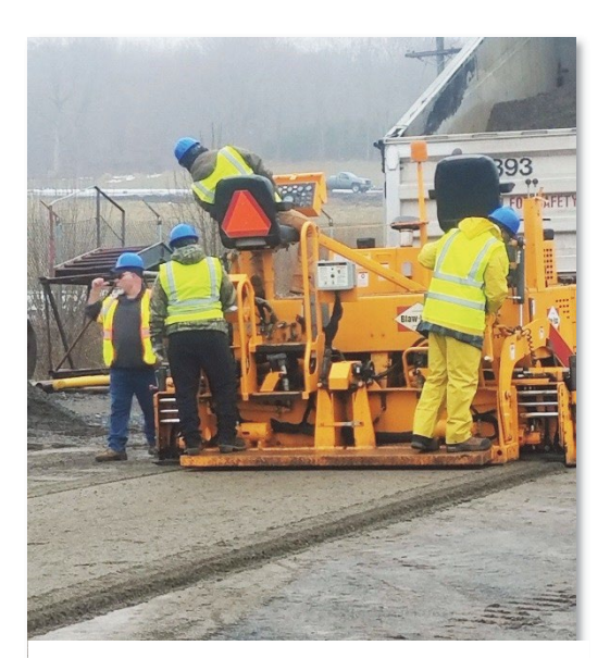
EWDJT Program: Northwest Regional Workforce Investment Board; Waterbury, CT

CareerOneStop Centers —The importance of partnering with WIBs cannot be overstated. In addition to student recruitment, screening, and support services, CareerOneStop Centers provide job placement services with staff and resources allocated to that function. Governmental employment services should be used only as a supplement—not a replacement—for EWDJT in-house program placement.