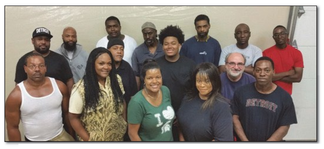
EWDJT Program: Detroit Environmental Employment Program; Detroit, MI

To understand how these programs and funding streams operate, consider the massive size of the DOL. While many DOL programs are administered nationally, in most cases employment and workforce development assistance is provided to states for administration. Accordingly, much of the responsibility for workforce development and training goes to local Workforce Investment Boards (WIBs), also called