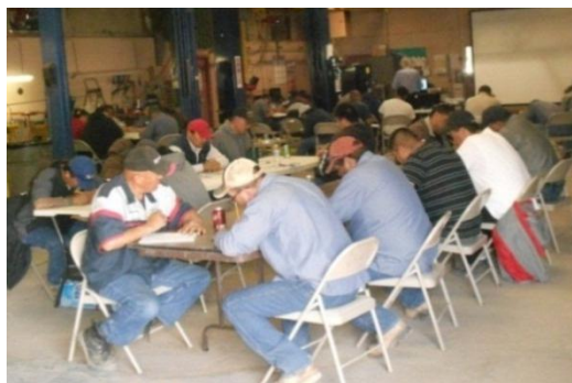
Figure 2. Navajo technicians taking the Section 609 certification exam in Window Rock, Arizona on April 29, 2013.

Eight follow-up telephone interviews were conducted with participants from five tribes to better understand the experience of the technicians, characteristics of the fleets they service, current MVAC servicing practices, and benefits gained from the training session. This section summarizes that information. The observations and conclusions of the case study are only representative of technicians from a subset of the tribal fleet service centers for which training was provided, based on information collected during the follow-up interviews.