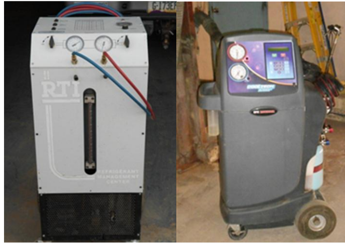
Figure 4. Examples of older (left) and newer (right) models of recovery and recycling machines among participating tribes.