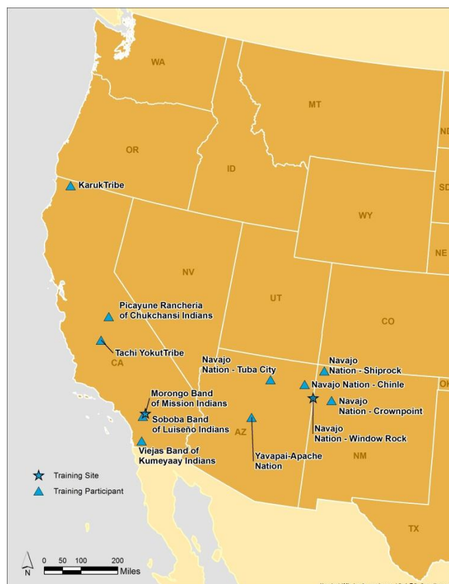
Figure 1. Location of participating tribes.

Each training session included several hours of classroom instruction by an EPA-approved technician training and certification program . The EPA-approved program provided the instruction and administered the exam using their training materials. All Section 609 certification programs must cover a standard set of topics, including the environmental benefits of reducing emissions of refrigerants with high global warming potential and proper use of refrigerant recovery equipment. Supplemental information on new alternative refrigerants HFC-152a, HFO-1234yf, and CO 2 , was also included for these sessions. At the end of the instruction period, the technicians