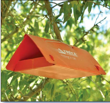
Figure 2. A navel orangeworm trap helps control pests in an almond tree.